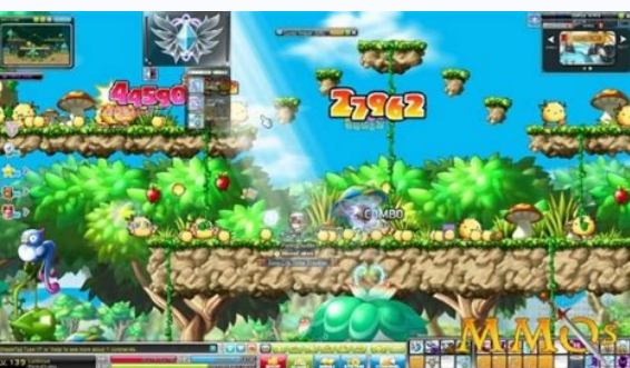
Is maplestory mobile the same.